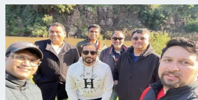
Australia/NZ Chapter GT