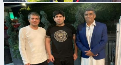
UK Chapter GT