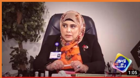
Director Interview with the Media IBA PU Alumni Association · 23 views · 6 days ago