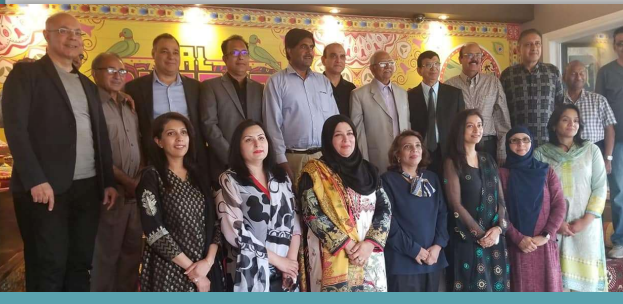
Canada Chapter Get-together 2020